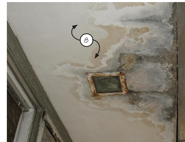
5 CANOPY CEILING NOT TO SCALE