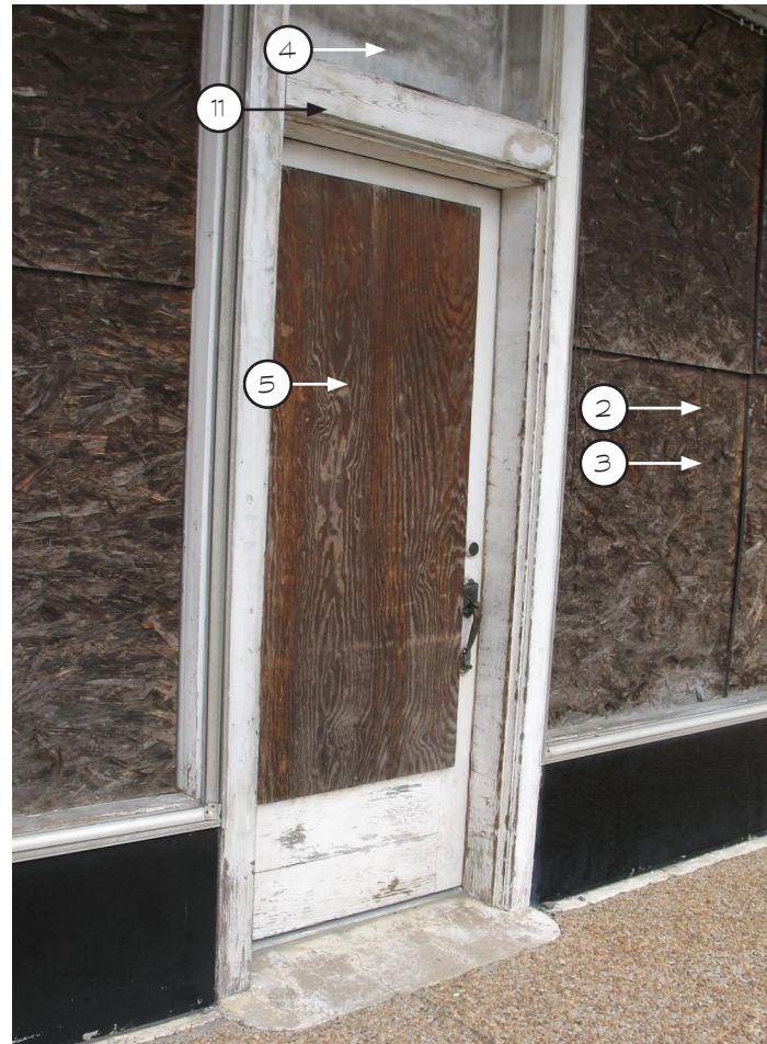
3 STOREFRONT DOOR NOT TO SCALE

PAINT: Benjamin Moore or approved equal. P-1: Walls: P-2: Trim: P-3: Doors: P-4: Accent: