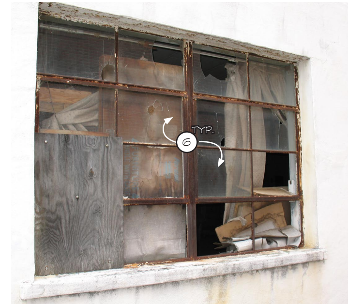
3 EXISTING WINDOW NOT TO SCALE