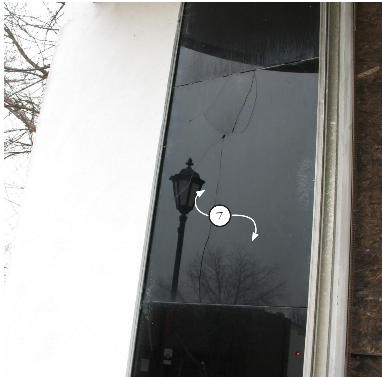
1 VITROLITE PANELS NOT TO SCALE