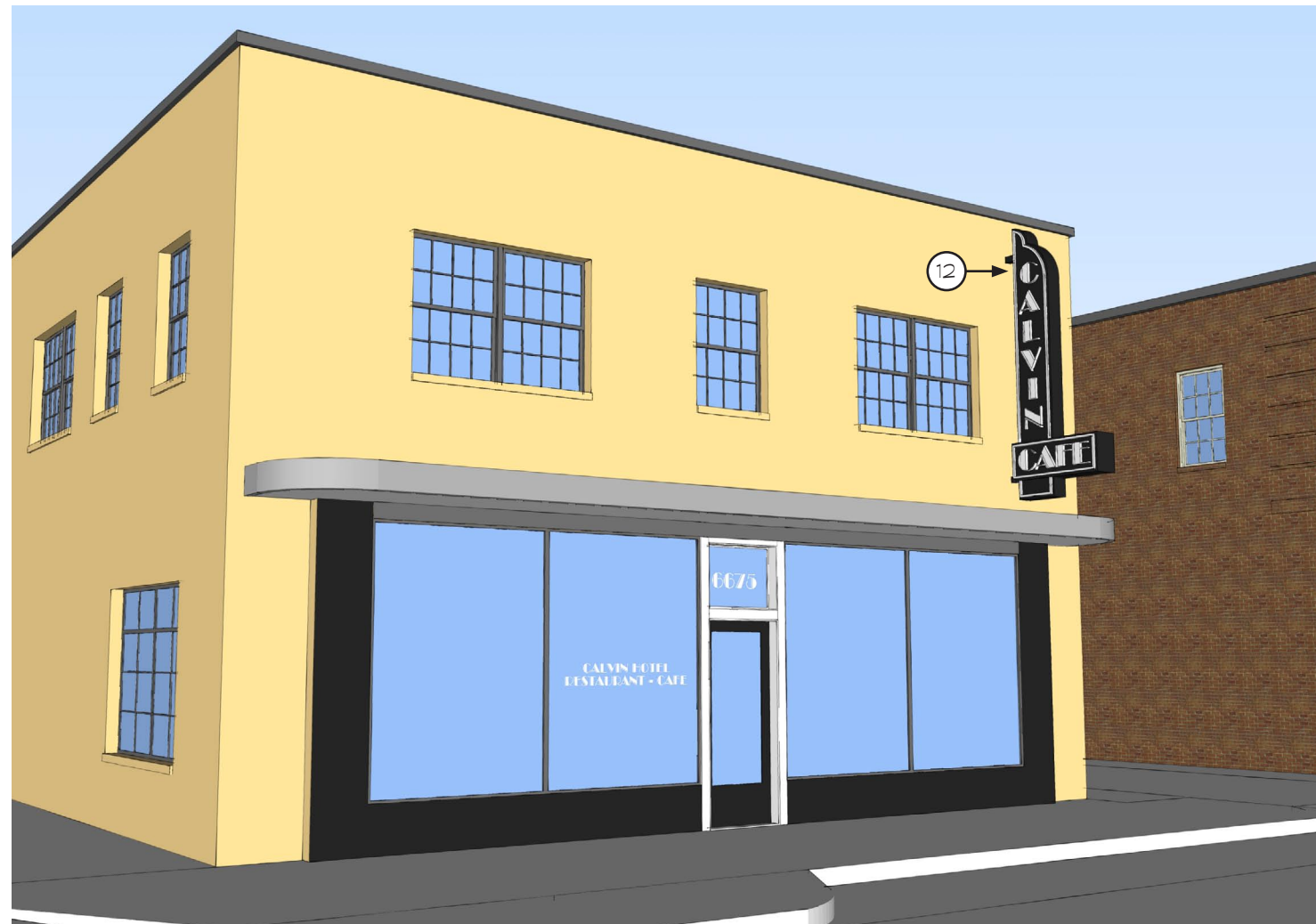
2 PROPOSED FACADE NOT TO SCALE

FINISHES AND PAINT COLORS: PAINT: Benjamin Moore or approved equal. P-1: Walls: HC-11 Marblehead Gold P-2: Trim: White P-3: Doors: Black P-4: Accent: AF-15 Steam