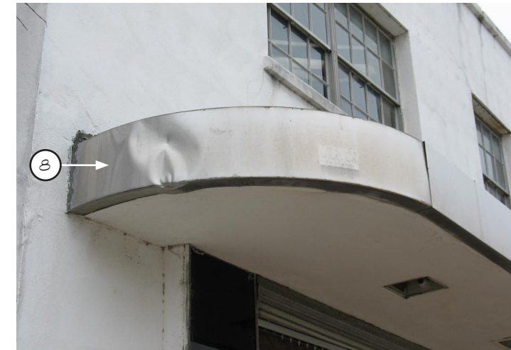
4 CANOPY TRIM NOT TO SCALE