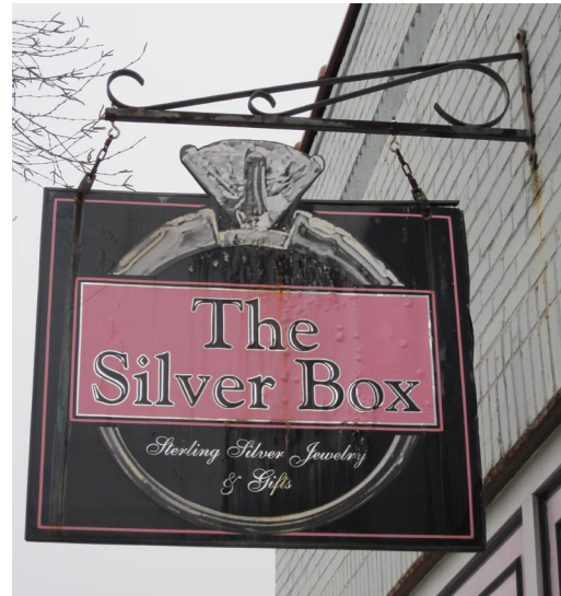
1 EXISTING SIGN NOT TO SCALE

SCHEMATIC DESIGN: This drawing is conceptual and not working drawings for construction. The notes are intended as guidelines for rehabilitation. Any changes to the conceptual design should be reviewed and approved by the Architect and Gloucester Main Street Association. Some aspects of the design may require further drawings prior to construction. Field Check any dimensions shown on this drawing. It is the responsibility of the owner and contractor to acquire additional technical or professional assistance as needed before or during construction.