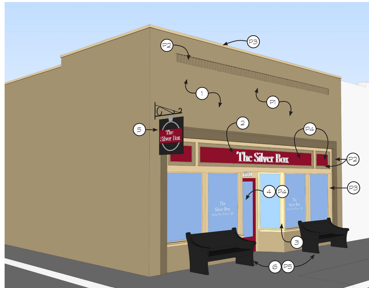
4 PROPOSED MAIN STREET FACADE NOT TO SCALE